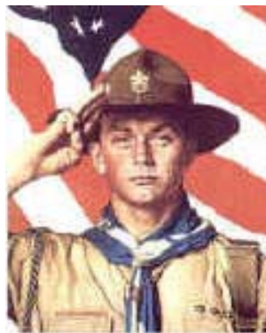
Attention District Committee Members,